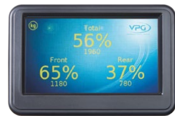
Each Axle Displayed as a Percentage