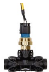
Air Pressure Transducer

5920 South 194th Street | Kent, WA 98032 | USA Ph: Toll Free 800-237-0022 or +1-919-219-6471 E-mail: obw.us@vpgsensors.com