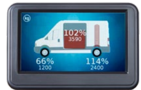
Rear Axle Overload Warning