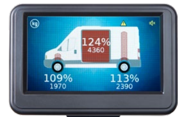
Gross Overload Warning